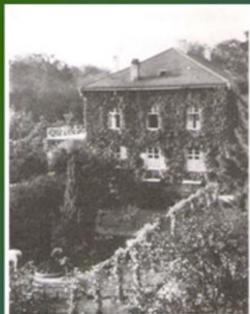
Wessenberg Institution for Juvenile Education