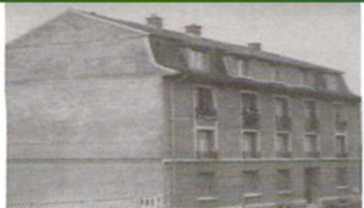
No. 46, Rue de la mer Rouge